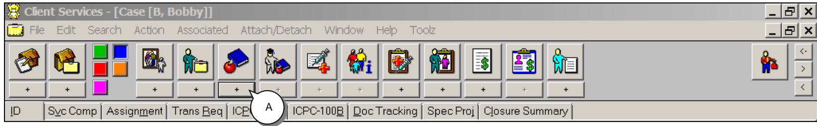
Figure – HE_035